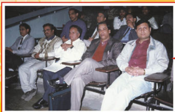
Participants listening to the lectures in the Kanpur Symposium during October 6-8, 2001.